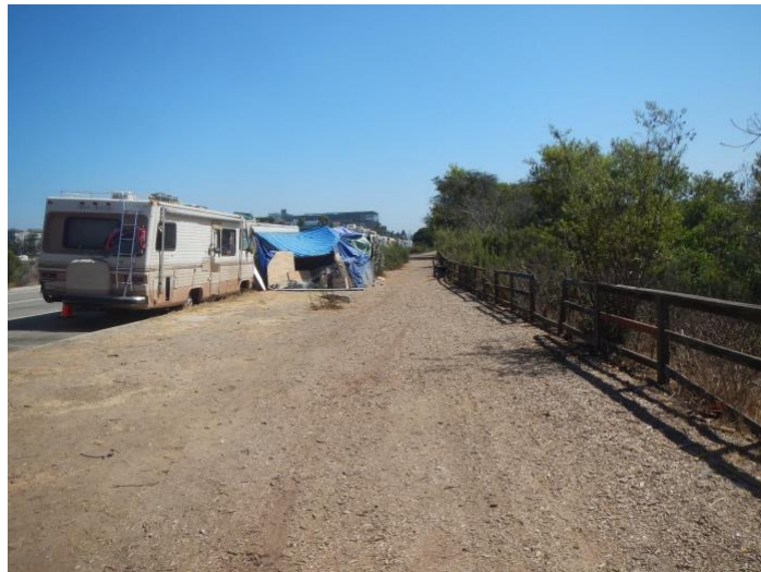
Exhibit A. Photo comparison, April 2016, event by Ted Lieu about legislation to expand the Santa Monica Recreation Area (left), and August 27, 2021, foreground missing shrubs on the left side of the trail that had been present back in 2016 (right).