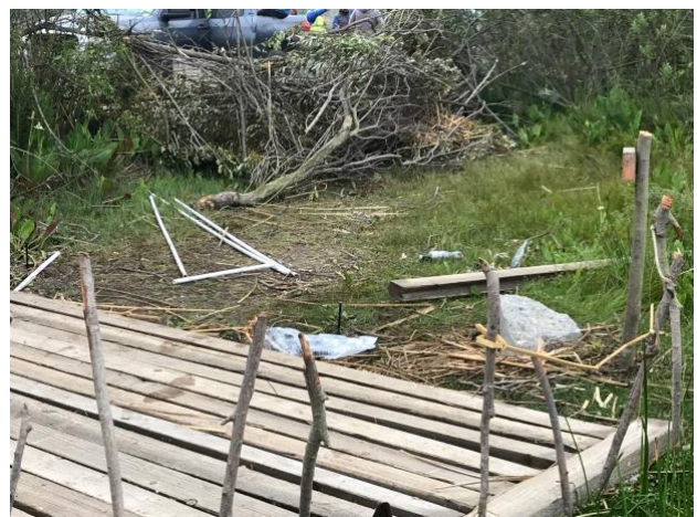
Exhibit G. Examples of habitat destruction and impacts to wildlife, including build-up of waste, damage to mature plants, impacts on nesting sites, large areas of native habitat lost, and wildlife following Marsh visitors expecting to be fed.

The native landscaped area between the street parking and the trail has been severely damaged and degraded. In addition to photographic documentation of the extent of trash accumulation and fence damage along the Jefferson edge, we assessed impacts to the native landscape between the public trail and the curb. This was done using aerial imagery from 2016,