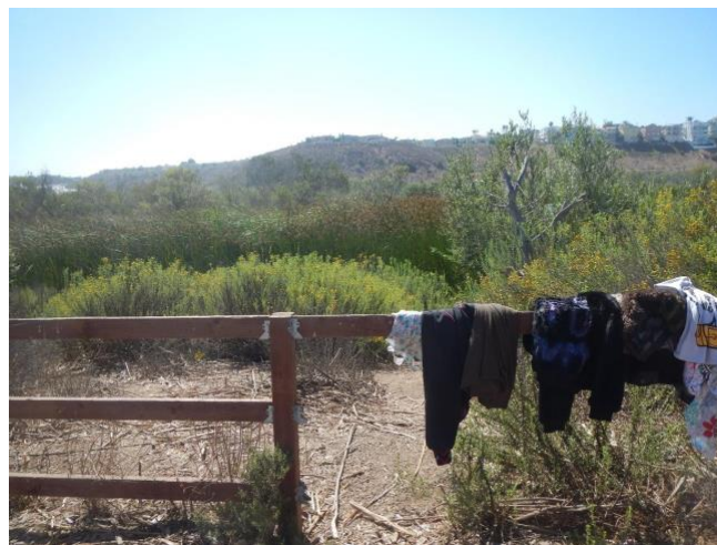
Exhibit B. Photo comparison, May 12, 2013 (left) to August 27, 2021 (right).