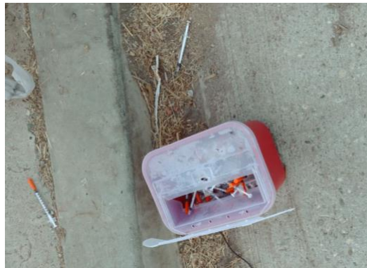
Exhibit D. RV's with BBQs, gasoline, spilling oil and chemicals, blocking the bike lane, syringes, and overflowing trash and litter covering the trail.

Off leash pets create significant issues for people and wildlife. Off leash dogs are a hazard for both visitors and wildlife; dogs run into oncoming traffic and scare marsh visitors by charging and barking. Dogs pose environmental concerns as well, as they are regularly found off leash along Jefferson and past the fence, scaring-off wildlife and running through the water and on the maintenance road. Dog and cat feces are not picked up by pet owners. A house cat along the trail may seem like a small quibble, but cats are a leading cause of death of wild birds, killing billions of birds each year. To introduce them into wild spaces that may be partially protected by roads from some urban predators is a disservice to the wildlife.