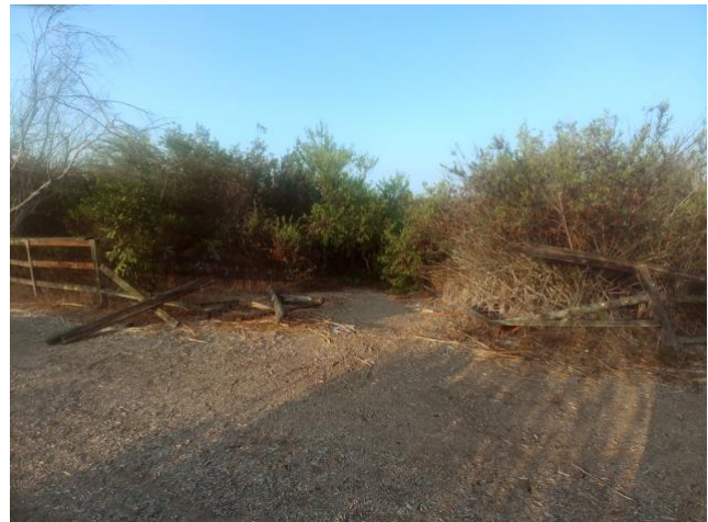
Exhibit F. Examples of gates and fences being repeatedly destroyed at the Marsh.

Furthermore, campers have been seen fishing and bathing in the water, using the marsh as a toilet, snaring birds (one bird was rescued by a local birder). Campers have severely impacted habitat availability and quality, by cutting down mature trees, digging up and driving over large established shrubs, creating large bare patches of exposed earth that once had thriving plant life, and degrading the soil and mulch layer, all which have consequences for wildlife and the health of the ecosystem. Wildlife forages through piles of trash and have been fed by the campers, which causes human habituation and spreads disease, both of which would result in death.