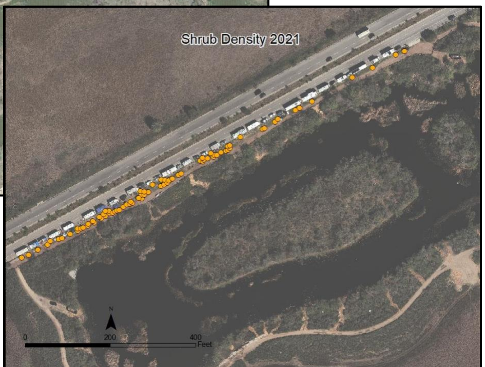
Exhibit H. Comparison of Shrub Density