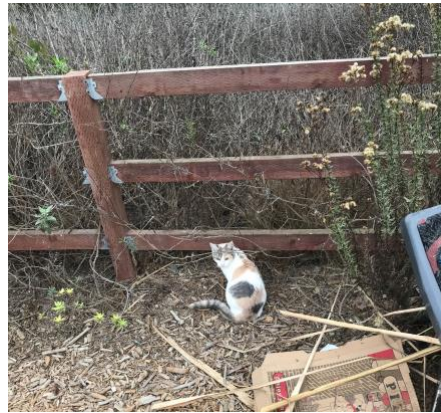
Exhibit E. Off leash pets at the Marsh.

The encampment has resulted in physical damage to Marsh infrastructure. Daily, the maintenance crew repairs damage as quickly as possible, but these attempts are often futile. Chains and locks are stolen on a regular basis, sometimes the day after they are replaced. Fences and gates are constantly kicked in or destroyed or used for firewood within days of being repaired. Monitoring equipment, repair materials, and tools have been stolen.