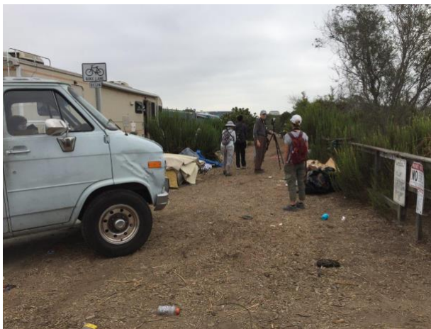
Exhibit C. Long line of RVs beginning at the start of the marsh and stretching to Lincoln Blvd. and parked in red zones and bike paths (top). A van blocking access to the marsh driveway while parking on the trail (bottom).

The encampments have greatly degraded the habitat quality of the marsh and created public safety and public health issues. Visitors, crew, and staff have been assaulted verbally and, in some cases, physically. A shooting occurred recently that left four RV dwellers hospitalized. The street, right-of-way, and trail are packed with hundreds of pounds of litter, human waste, BBQ grills, tents, furniture and more. There are also campfires, gasoline tanks, propane tanks, gas-powered generators, bike chop-shops, car repair pop-up shops, and off leash dogs and free roaming cats. The bike lane is perpetually blocked so cyclists must venture into the driving lanes to get around cones, RV pop-outs, improperly parked cars, debris, and more. This is dangerous because cars drive too fast on Jefferson Blvd. and often do not slow down when passing the encampment.